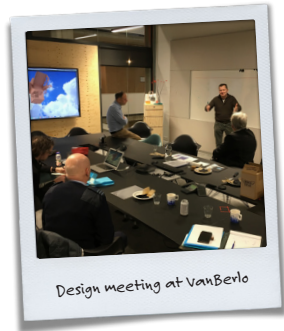
Design meeting at VanBerlo

Now that the specially designed R&D Aircraft has been presented at the beneficiary concert, we focus on the development of the cargo bays. With assistance of the Royal Netherlands Air Force dropping experts, we discuss the next generation of the cargo delivery box. It has to withstand airspeeds of 90km/hr and land safely on the calculated delivery point.