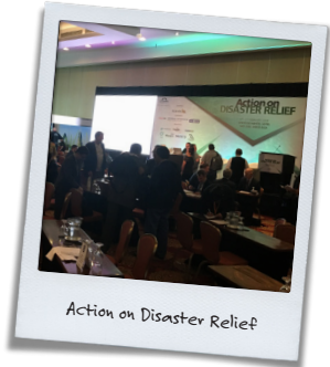
Action on Disaster Relief

In parallel to the product development, it is time to spread the word internationally. We join Action on Disaster Relief 2019 in Costa Rica, where we discuss and finetune the service proposition with key stakeholders in the humanitarian supply chain. Panel discussions teach us that there is still a lot of waste, since there is not always enough information to program logistics. Can modern technology give more voice to local communities? From a UK expert, we learn about water purification filters.