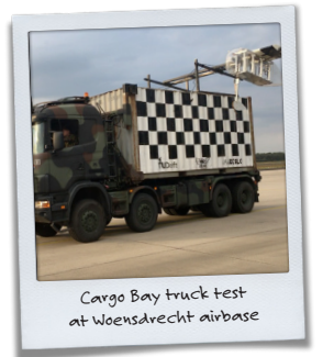
Cargo Bay truck test at Woensdrecht airbase