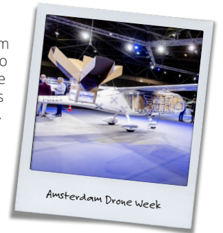
Amsterdam Drone Week

Barry represents the Platform for Unmanned Cargo Aircraft at the EASA conference. The topic is hot: end of June 2020, the first EASA regulations on remotely piloted aircraft will come into play. We are ready for it!