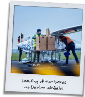
Loading of the boxes at Deelen airfield

Rhenus Logistics puts up a booth at the Amsterdam Drone Week and poses the question: "Are cargo drones a game changer for the industry?" With the Wings For Aid aircraft and box right in front, this leads to lively dialogues.