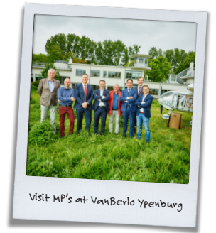
Visit MP's at VanBerlo Ypenburg