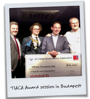
TIACA Award session in Budapest

WOW! Our box wins the first Sustainability Award from The International Air Cargo Association. After a delegate vote at the member conference in Budapest, we are awarded for our commitment to bio-based materials and social inclusion. What an honour to feel our 'reaching people anywhere' slogan resonate in the industry. The $15,000 will be invested in further development.